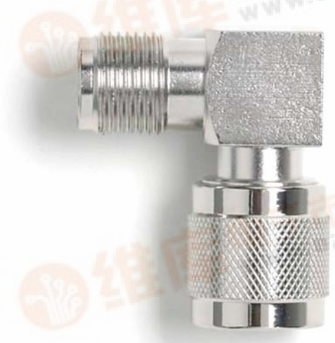
Model 73053 TNC Right-Angle Jack to Plug Adapter