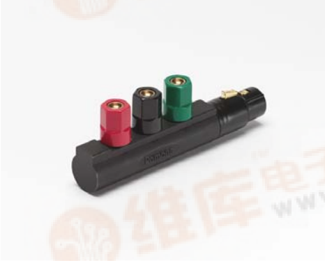
Model 7287 XLR (F) / Triple Binding Post