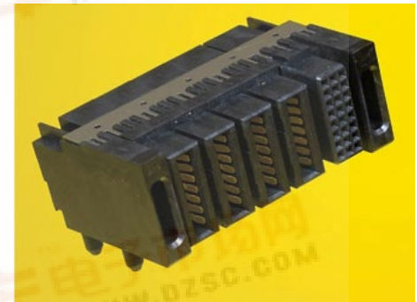
Vertical Socket Assembly (Series 75541)