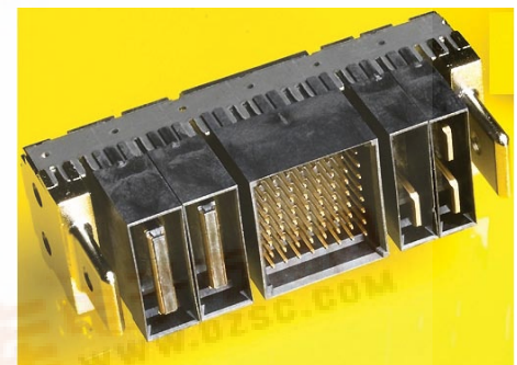
Right-Angle Receptacle (Series 45840)