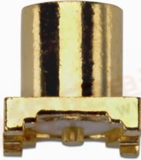
Model 73018 MCX JACK STRAIGHT SURFACE MOUNT RECEPTACLE

Snap-on coupling and miniature size for fast connect and disconnect where space is limited.