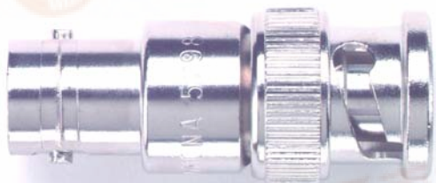
Model 5298 Triaxial 2 Lug (F) To BNC (M) Adapter