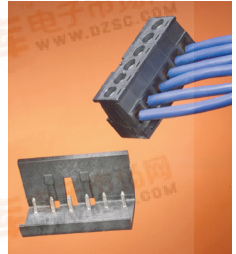
4.00mm (.157") Positive-Locking Terminal Block System