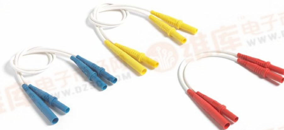
Model 73087, Jumper Test Lead Set