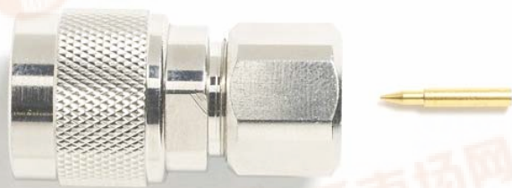
Model 73051 N Type Plug, 50 Ohm, Clamp Type, RG8, 213