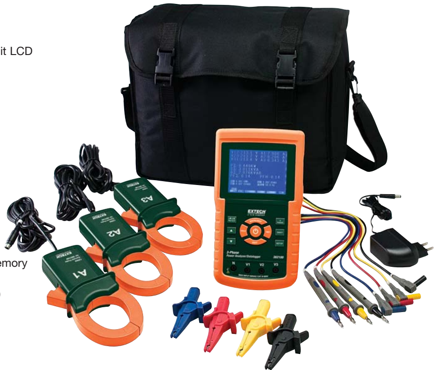
Complete with 3 current clamps, 4 voltage leads with alligator clips, 8 AA batteries, SD memory card, Universal AC adaptor (100 to 240V), and case