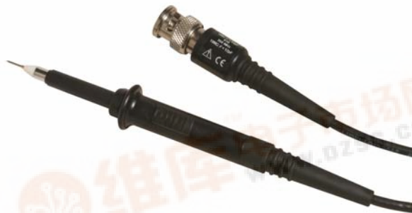
Model 6496 Modular Passive Oscilloscope Probe