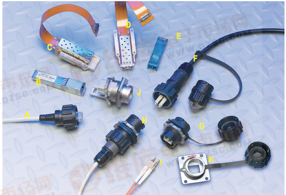
Left to right: A = Optical Industrial Ethernet Cable, B = Electrical RJ-45 to SFP Transceiver, C = Electrical Sealed SFP Module, D = Optical Sealed SFP Module, E = Optical SFP Transceiver, F = Industrial LC Cable Assembly with Cable Assembly Dust Cap, G = Industrial LC Adapter, H = In-Line Industrial LC Adapter Mated to an Industrial LC Cable Assembly, I = Duplex LC Cable Assembly, J = Sealed SFP Receptacle for Integrated Platforms C and D, K = Simplified SFP Receptacle

Molex also offers a Simplified SFP Receptacle, which allows end users to design their own board layout and transceiver options. The actual transceiver cage is positioned directly into the rear of the receptacle by the customer in accordance with the optical plane and front-end connectivity guidance provided by Molex.