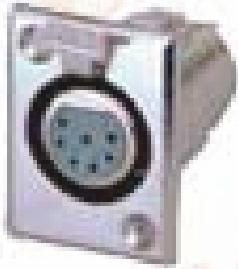
Model 6854 XLR (F) 5-pin rectangular flanged mount

Protect contacts and absorb vibrations in your audio applications.