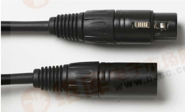
Model 6869-180*, -300*: XLR Plug/Jack Cable 15 feet, 25 feet