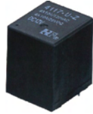
Dust Covered 17.5×15×20