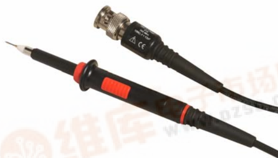
Model 6491 Modular Passive Oscilloscope Probe