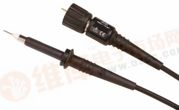
Model 6554 Microline Passive Oscilloscope Probe