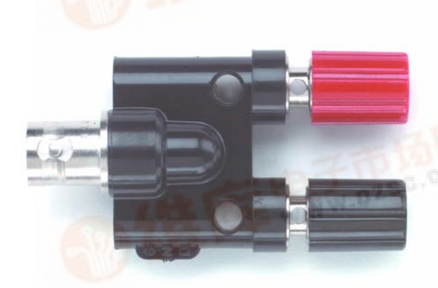
Model 1452 Adapter-Binding Posts to BNC Receptacle