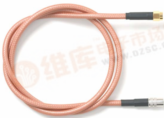
Model 73082 SMA Quick-Connect Plug to SMA Plug, RG142B/U

Small size, and durability for confident connections