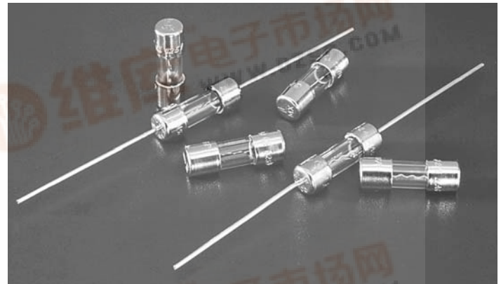
225 000 Series

Contact Littelfuse concerning other ampere ratings.