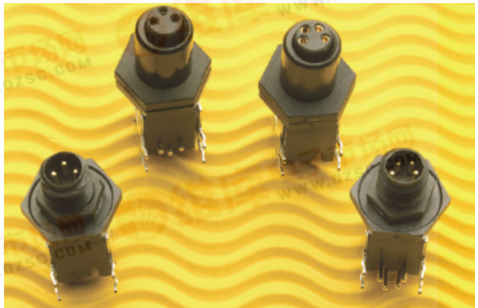
Metal latch plugs into PCB for increased board retention

Packaging: Bag Mates With: Nano-C cordsets, Series 84592 Designed In: Inches