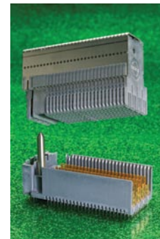
4 and 5-pair: