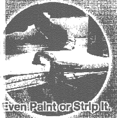
Even Paint or Strip it.

S queeze to adjust and lock. Click to release. Lightweight and portable, use it on the job, in the workshop, garden, garage even camping... What can't you do with a QUICK-GRIP® HAND I-CLAMP™?