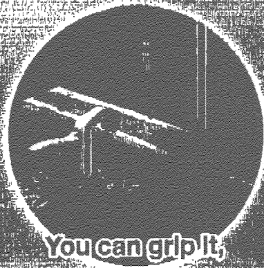
You can grip it,