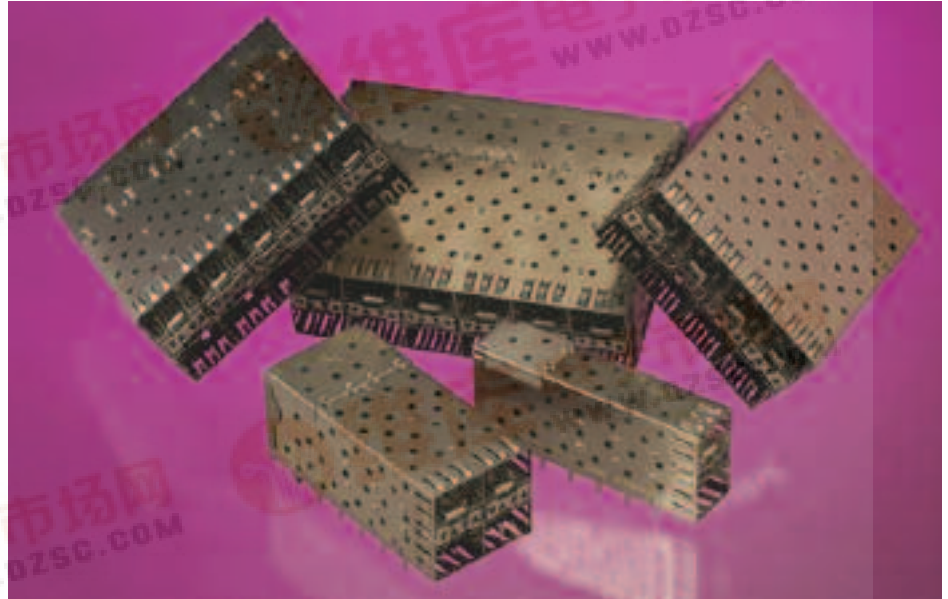
Multi-port connectors with lightpipes

75310, 75786, 75460, 75787, 75462, 75640, 75759, 75714, 75454, 75450, 75733, 75734, 75477, 75451