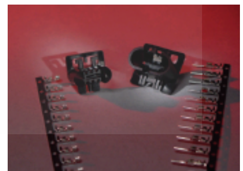
6-pin wire-to-wire, panel-mount connector