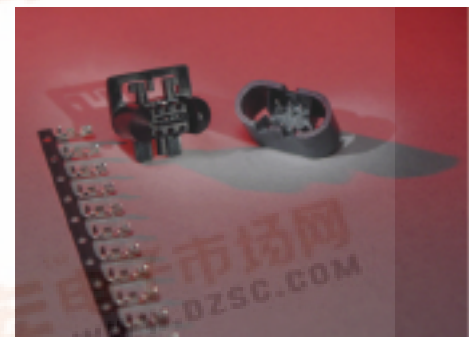
6-pin wire-to-board, vertical connector